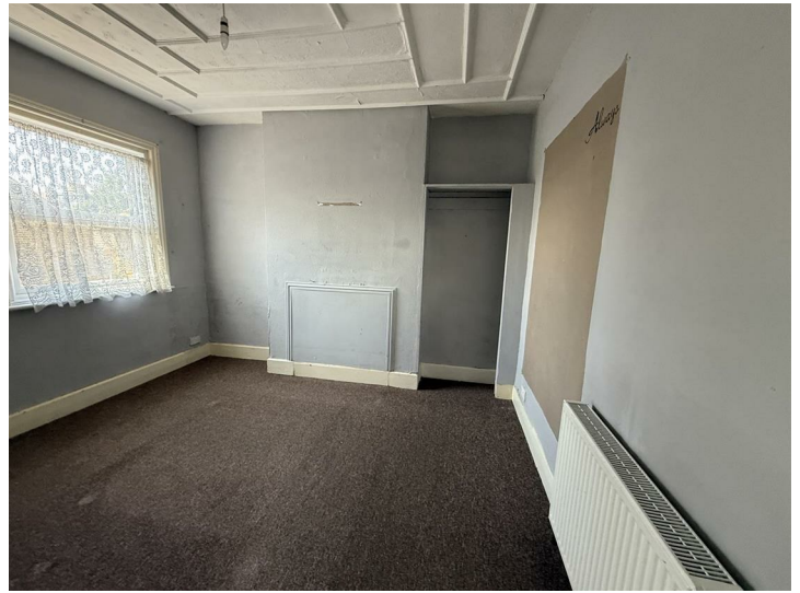
Bedroom 2 8'0 x 6'7 (2.44m x 2.01m)