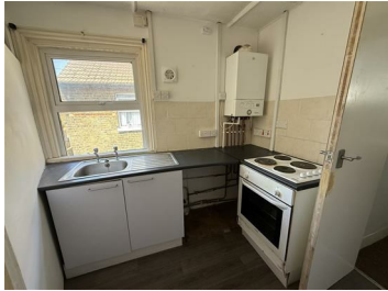
Kitchen 9'5 x 7'10 (2.87m x 2.39m)