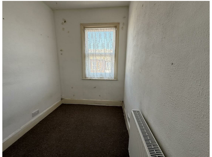
Bathroom 9'6 x 4'1 (2.90m x 1.24m)