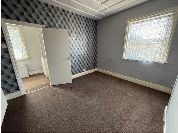
Lounge 11'6 x 10'9 (3.51m x 3.28m)